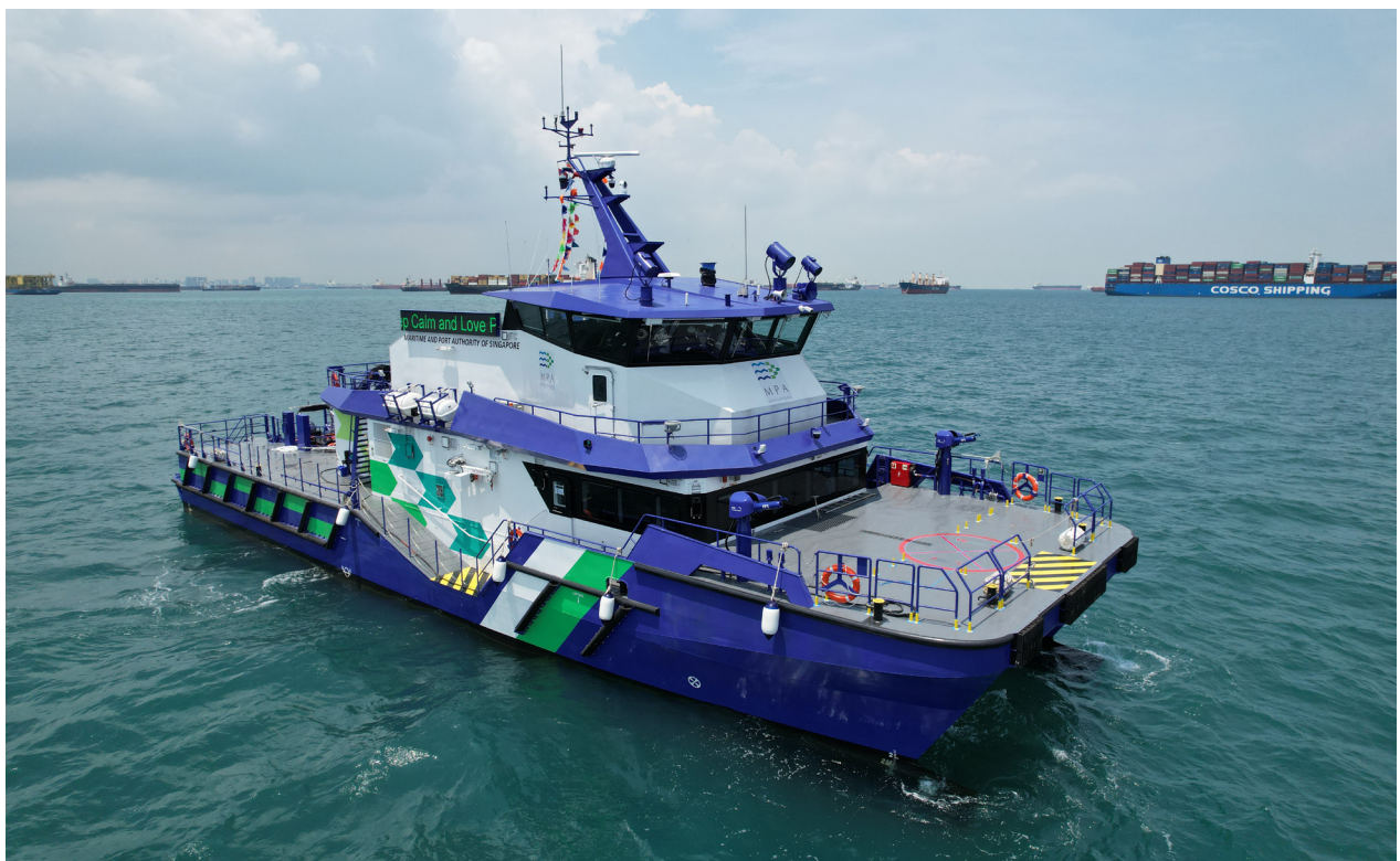
Delivered in 2022, the BMT-designed MPA Guardian utilises a parallel hybrid system to full effect

BMT likens this proposed vessel to MPA Guardian, the 27knots-capable, BMT-designed patrol/rescue boat delivered to the Port of Singapore last year (see Significant Small Ships of 2022 and Ship & Boat